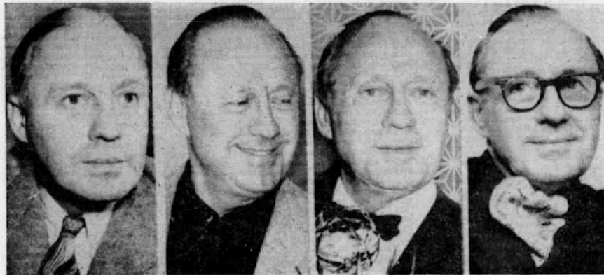
JACK BENNY over 30 years. Little change in appearance; none in attitude

I've seen Hope put in a 16-18 hour work day and never show the strain, while those around him — a fraction of his age — were ready to collapse from the pace and the pressure.