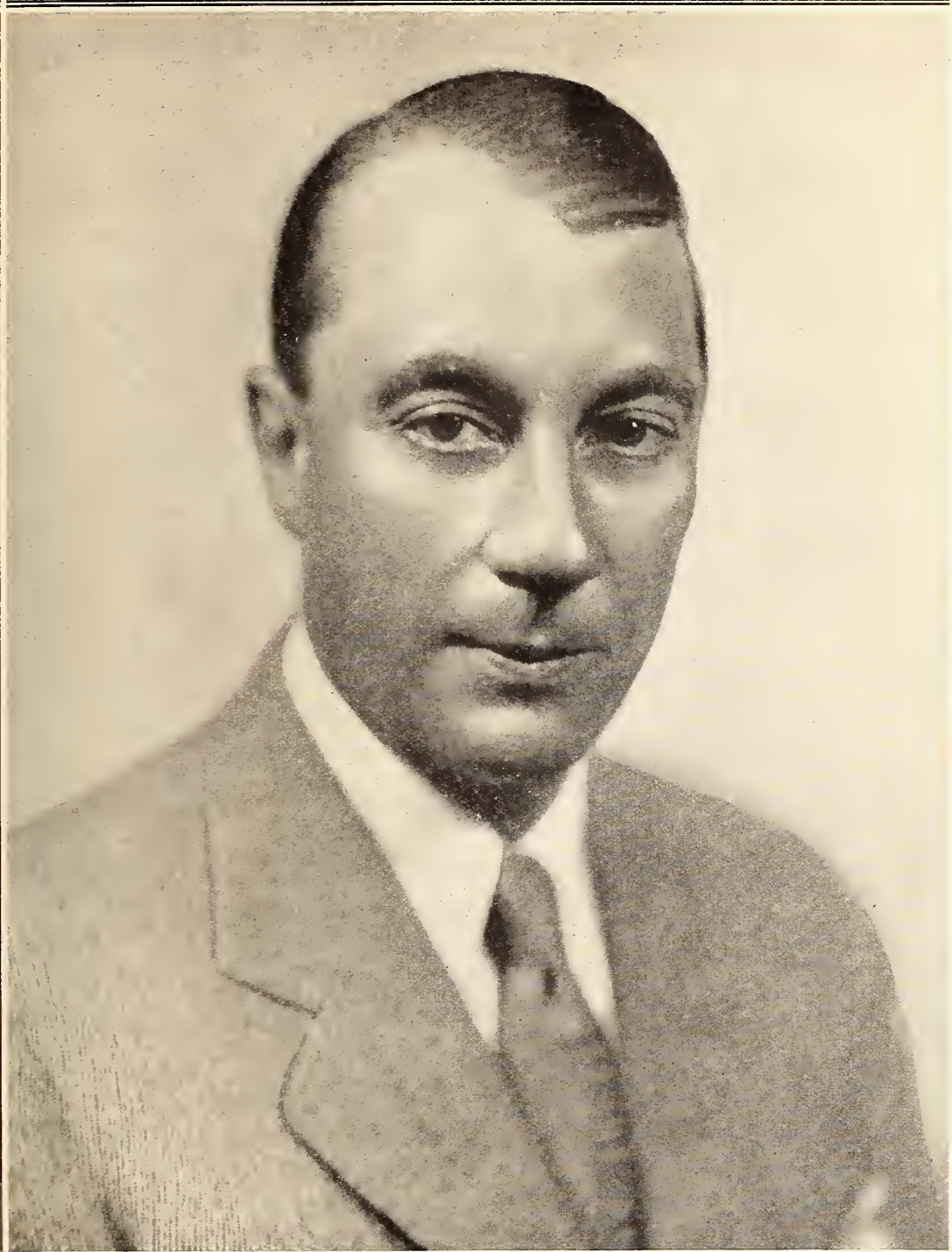
GRAHAM McNAMEE — NBC Announcer